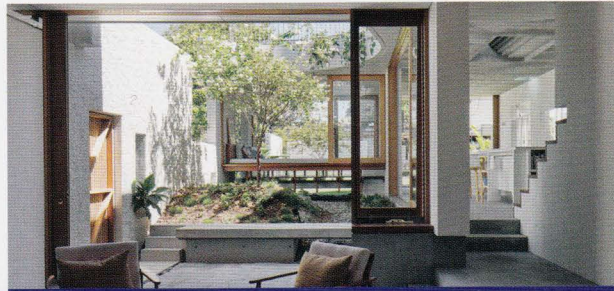
Gibbon Street (Qld) by Cavill Architects.