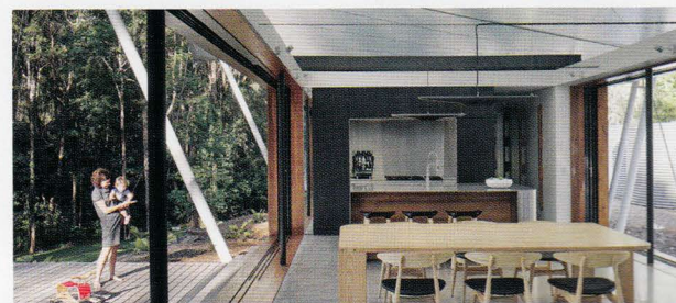
Tent House (Qld) by Sparks Architects.

See more, visit housesawards.com.au/gallery